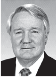
CONGRESSMAN JOHN BRYANT CHAIRMAN OF THE BOARD

"Education is the most powerful weapon which we can use to change the world."